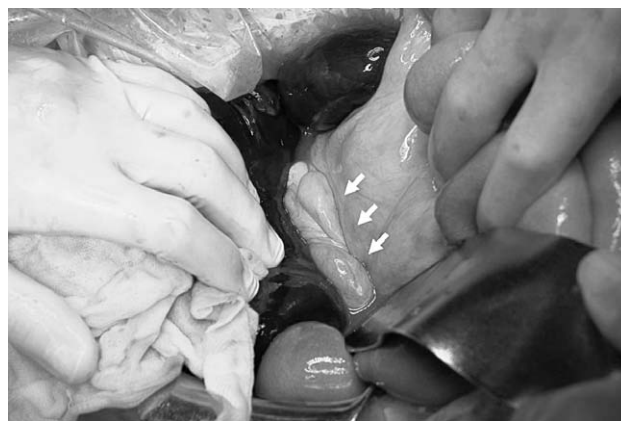
Fig. 3 (b) Ileosigmoid knot (white arrows) with gangrenous ileum and sigmoid colon.

reported harmful effects of MRI on the pregnant woman or fetus. However, the National Radiological Protection Board in the United Kingdom advises that MRI be avoided in the first trimester because there is limited experience assessing its safety during organogenesis. MRI for acute abdomen in pregnancy should be further evaluated in clinical studies.