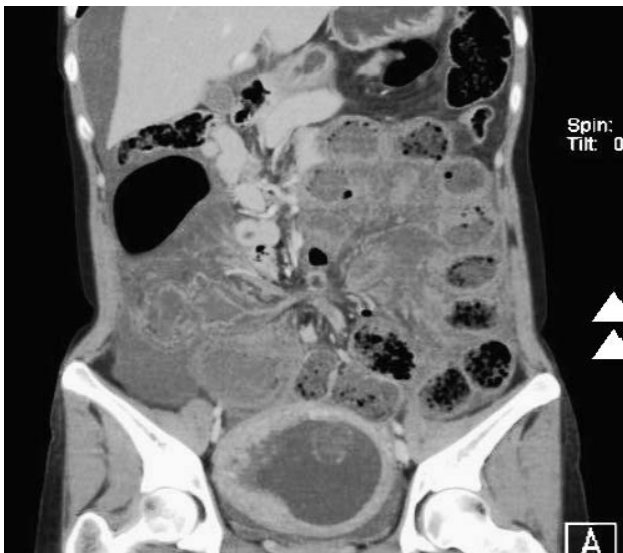
Fig. 2 (b) Contrast-enhanced CT scan (coronal view) shows distended sigmoid colon (white arrowhead).

The gold standard radiographic imaging modality for the evaluation of acute abdomen, including ISK, is CT with high spatial resolution. The safety of radiation exposure during pregnancy is a common