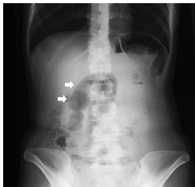
Fig. 1 An abdominal X-ray reveals a sigmoid colon loop (white arrows) in the mid-abdomen.

ISK is a rare form of bowel obstruction in which the ileum wraps around the base of the sigmoid colon. ISK is predominately seen in male patients (80.2%) with mean age of 40 years (range, 4–90 years). 1,2 Several studies have reported the relationship