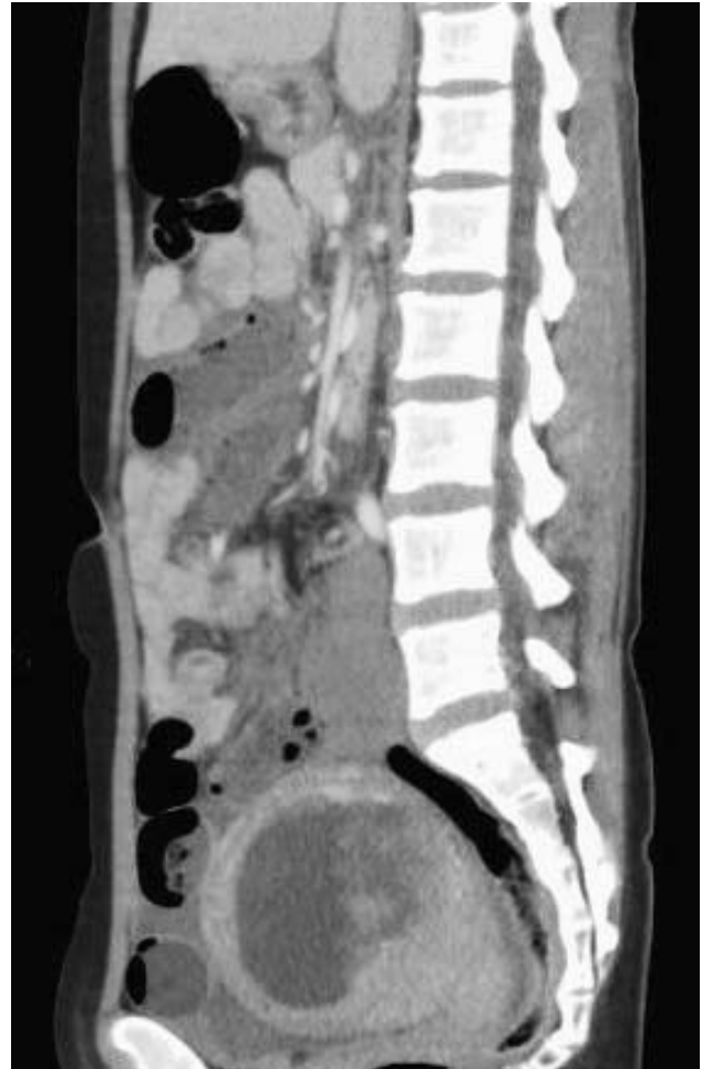
Fig. 2 (c) Contrast-enhanced CT scan (sagittal view).

concern. Radiation exposure to pregnant women undergoing medical imaging procedures and the management of such patients are difficult topics to address. There are radiation-related risks throughout pregnancy, and these risks are associated with the stage of pregnancy and absorbed dose. To diminish these prenatal risks, the radiation dose should be minimized. The first-line examination of a pregnant woman with abdominal pain should be US, which is free from radiation exposure, less expensive, and comparatively safer than CT. However, the skill level of the operator greatly influences the results. Moreover, Lazarus et al 12 found that CT findings provided important diagnostic information in 30% of pregnant women with abdominal pain who were determined to have normal US findings. On the other hand, the efficacy of magnetic resonance imaging (MRI) has been reported for the diagnosis of acute abdomen in adults. 13 There are no