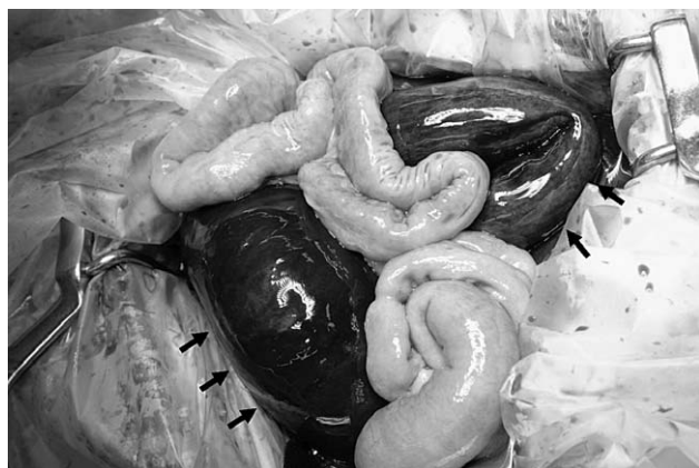
Fig. 3 (a) Intraoperative photograph shows gangrenous change in the ileum and sigmoid colon (black arrows).