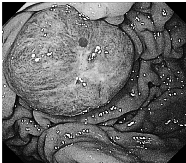
Fig. 1 Gastric endoscopy reveals a solitary, distinctly protruding lesion, with a central depression, at the greater curvature of the middle gastric body.

The patient's postoperative course was uneventful, and he was treated with everolimus, an mTOR