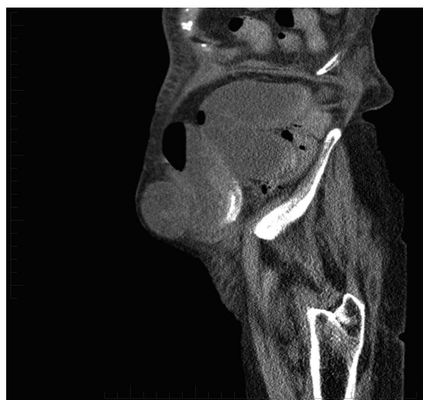
Fig. 2 Sagittal computer topography images of the patient on postoperative day 5. A hernia can be visualized in the left iliac fossa at her left flank laparoscopic port site.

A literature search was conducted in Ovid and Cochrane databases using the following search strategy: ((Port site hernia) OR (Laparoscopic port hernia) OR (trocar site hernia)) AND ((5-mm) OR (5mm) OR (five mm)). The date last searched was 29 May 2016. Reference lists of relevant studies were searched by hand to identify additional publications. Studies were excluded if they were not written in English or did not specify port size. Studies