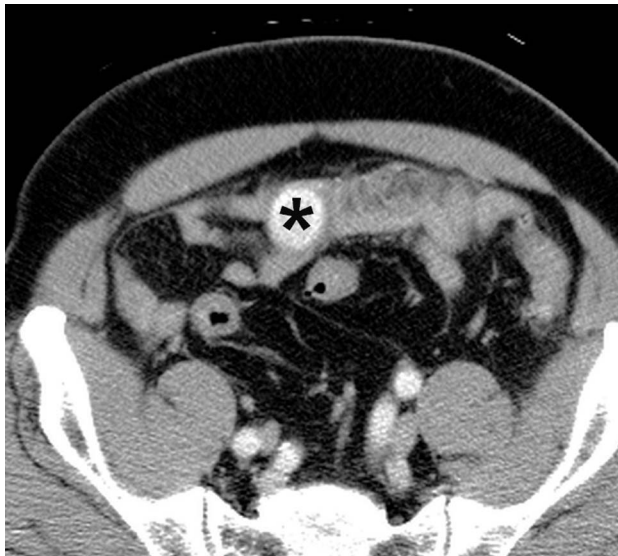
Fig. 2 The missing stone was found in the lumen of the small intestine over the lower abdomen. Asterisk, gallstone.

logic studies showed several small bowel perforations on the necrotic walls. The patient had no episodes of cholangitis or cholecystitis in the following year. An abdominal CT scan performed after an attack of sigmoid diverticulitis 1 year later showed that the inflammation around the gallbladder had subsided (Fig. 1b).