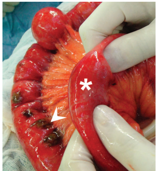
Fig. 3 The stone (asterisk) impacted in the lumen could be easily palpated. Note the 4 areas of necrotic wall (arrowhead) on the left in this photo, and some purulent coating in the jejunum.

Gallstone ileus is an uncommon disease and accounts for 1% of cases of mechanical intestinal obstruction. Bowel perforation after gallstone ileus is very rare. To our knowledge, only 10 other cases have been reported in the literature. The perforated site can be located in the jejunum, ileum, or sigmoid. 6–15 The possible mechanism is that mucosal ulcer with bowel perforation can develop after direct high-pressure compression by an impacted stone. The impacted stone also can cause severe bowel obstruction, leading to high intraluminal pressure in the jejunum. Finally, such high pressure can result in bowel ischemic necrosis or perforation, especially in patients with jejunal diverticula. 7–9 Our patient had rapidly progressed within 1 day to having acute abdominal pain, total bowel obstruction, and rapidly elevated intraluminal pressure compromising the perfusion of bowel to several patches of wall necrosis. The reason for such rapidly progressing disease was associated with his underlying cardiovascular disease and a huge stone in the