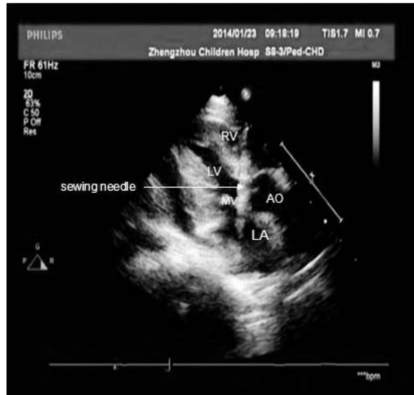
Fig. 2 Transthoracic echocardiography revealed a linear metallic foreign body within the heart. RV, right ventricle; LV, left ventricle; LA, left atrium; AO, aorta; MV, mitral valve.

successfully removed by catching it with a clamp from the left atrium (Fig. 3). Remarkable fibrous deposits could be seen in the heart around this needle and were removed during the surgery. The pericardium was irrigated with antibiotic solution. The operation was completed without any complication. Recovery was uneventful, and she was discharged 8 days after the surgery.